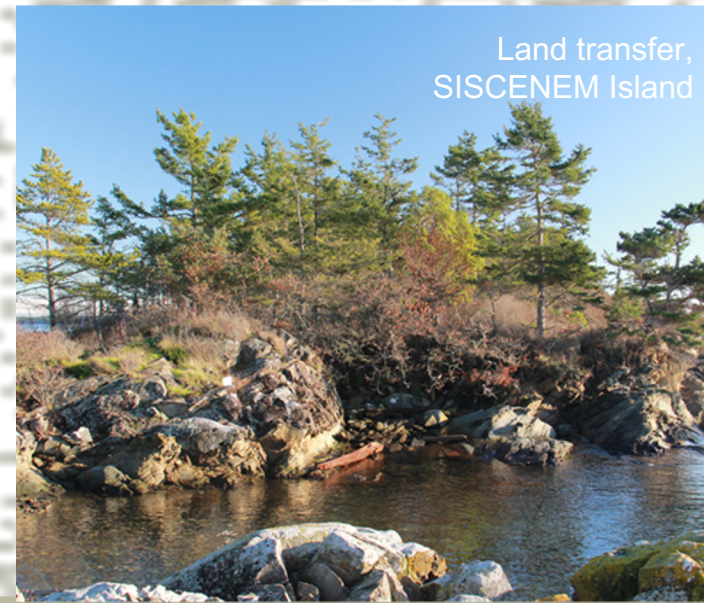
Land transfer, SISCENEM Island